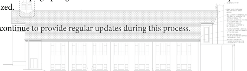
Drawing For Illustrative Purposes Only

The Committee will continue to provide regular updates during this process.